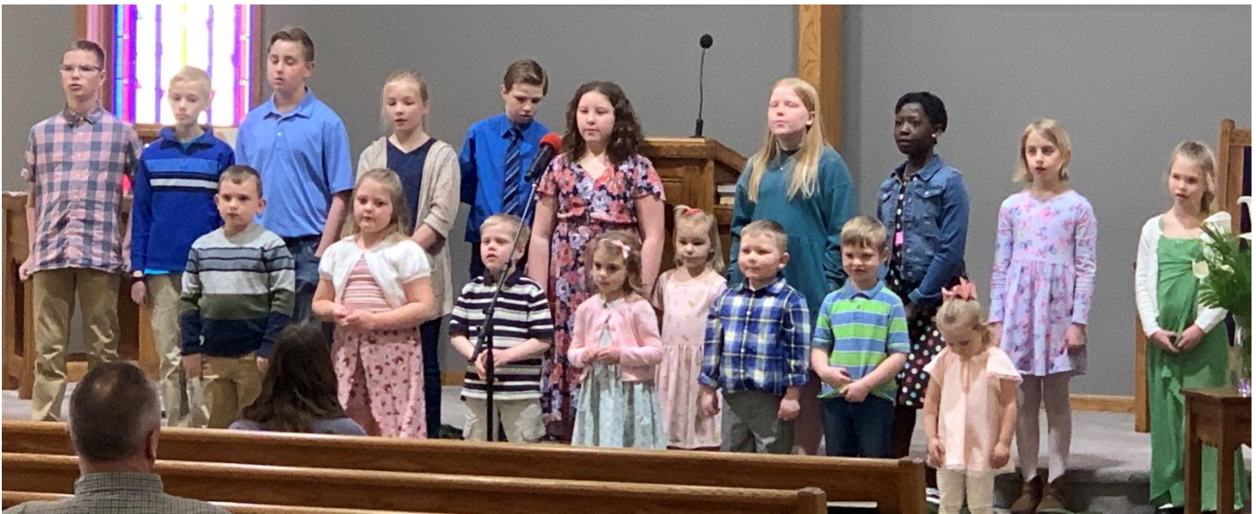
Sunday School Palm Sunday Program - March 28th